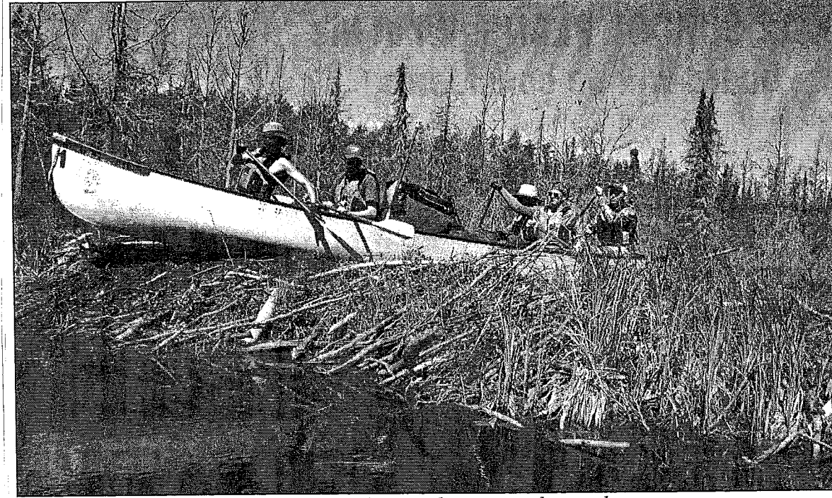
Boys brigade one almost makes it over a beaver dam....