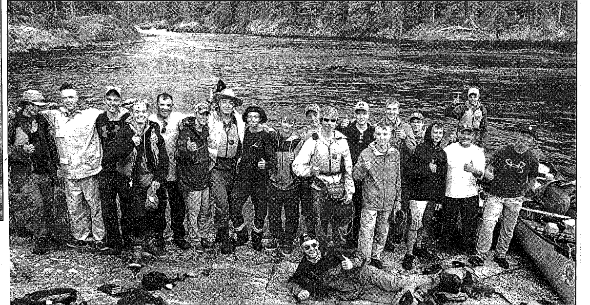
That's all the boys, at the end of the Split Rock Falls portage, near the end of the 12-day spring trip.